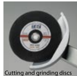
Cutting and grinding discs