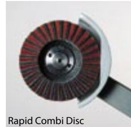
Rapid Combi Disc