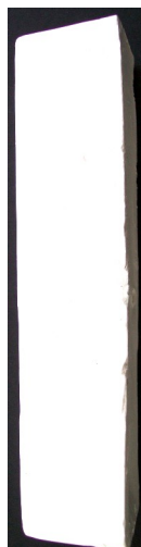
PO1005 White Hyfin