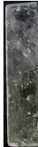
PO1006 Black Coarse Cut