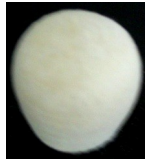
PO5023 A23 Felt