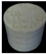
PO5041 W230 Felt