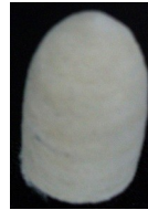
PO5012 A12 Felt