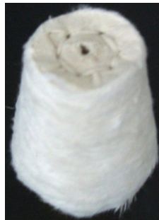
PO5164 63mm Taper