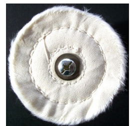
PO5350 WSM 3" 50 Fold