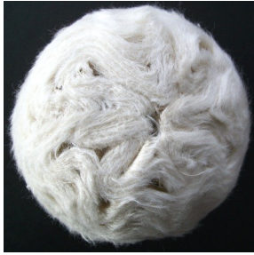
PO5100 4" Mushroom