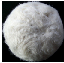
PO5075 3" Mushroom