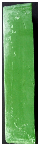
PO1002 Green Lime