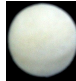
PO5040 A40 Felt