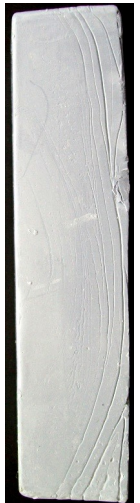
PO1004 Grey Carbrax