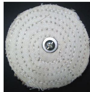
PO6100 100mm x 6mm Sisal