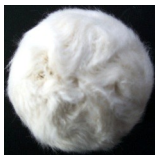
PO5050 2" Mushroom