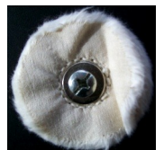
PO5250 WSM 2" 50 Fold