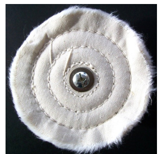
PO5450 WSM 4" 50 Fold