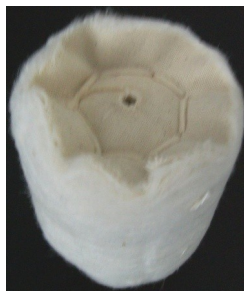
PO5163 63mm Drum